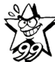
csOA Officina 99 www.officina99.org